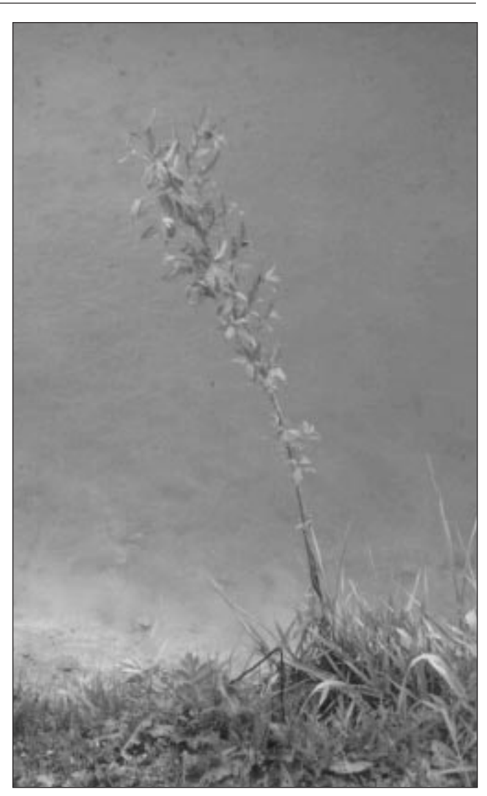
Rooted willow cuttings are available from MNR tree nurseries, private nurseries and MAPLE — the Mutual Association for the Protection of Lake Environments in Ontario Inc.

Produced by the Land Owner Resource Centre and the Ontario Ministry of Natural Resources' Southern Region Science and Technology Transfer Unit.