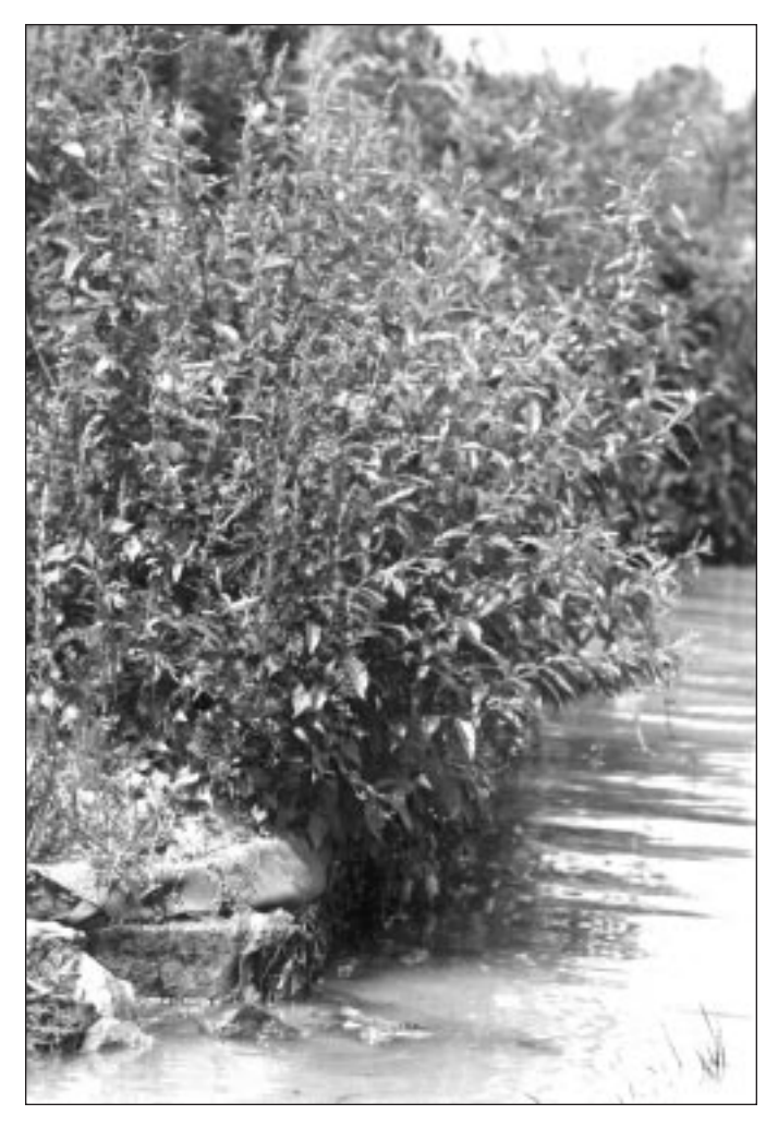
Willows stabilize fragile shorelines, reducing soil erosion and flood damage.