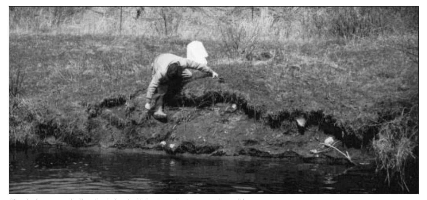
Plant the lowest row of willows just below the high water mark of a stream, river or lake.