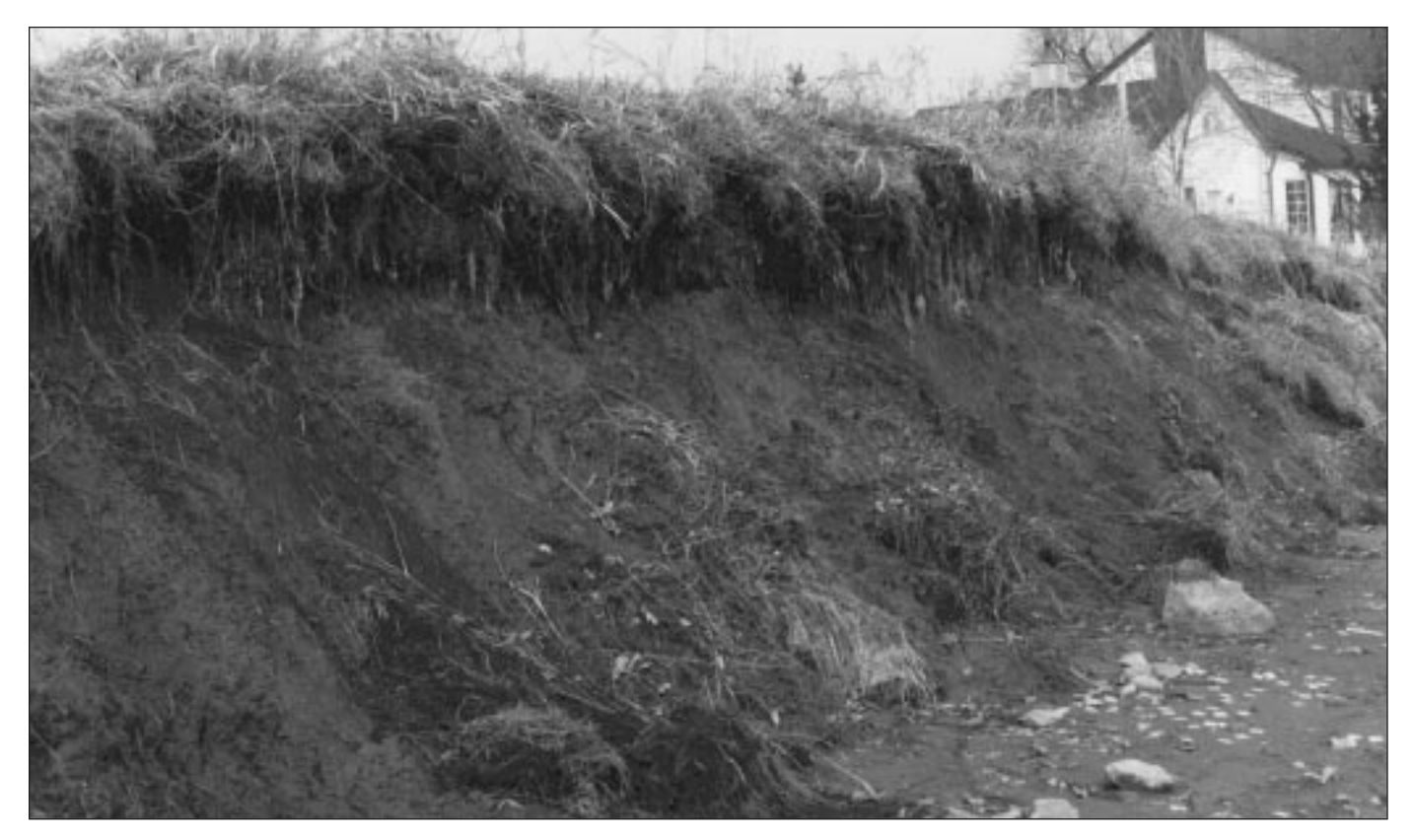
Wave action and flooding can erode shorelines that are not protected by natural shoreline plants.