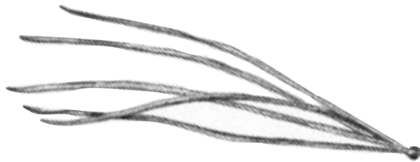
White pine needles are clustered in groups of five.

They are six to 20 centimetres long and about 2.5 centimetres wide. Soon after the cones mature, they open and release winged seeds.