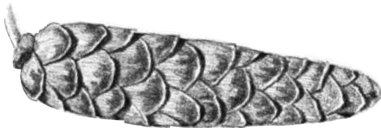
Immature white pine cone.