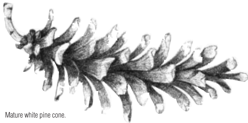
Mature white pine cone.