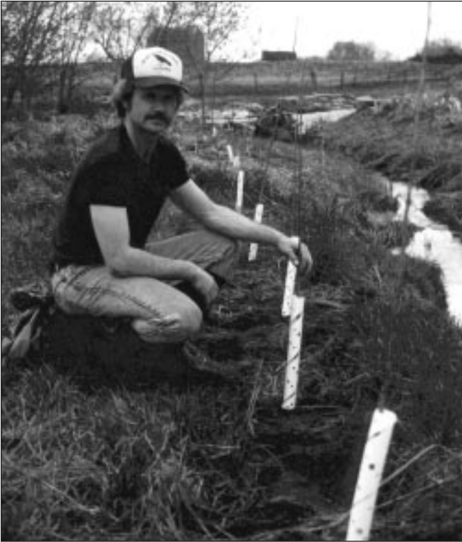
Tree guards are an effective way of protecting trees from rodent damage. These 12-inch guards have been cut down from 24-inch guards to reduce the cost.