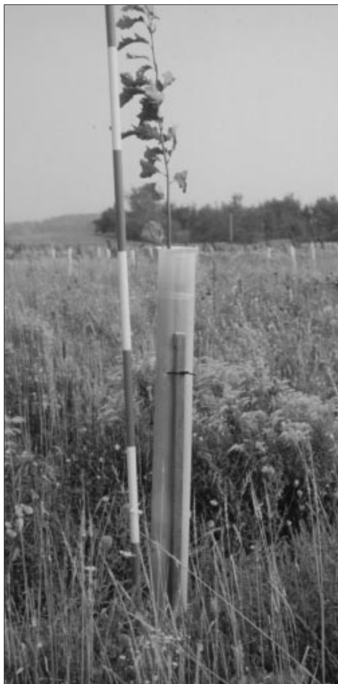
Tree shelters protect trees from damage by voles, rabbits and other rodents.

Thiram, marketed under various trade names, is one of the better known repellents. Another option, denatonium