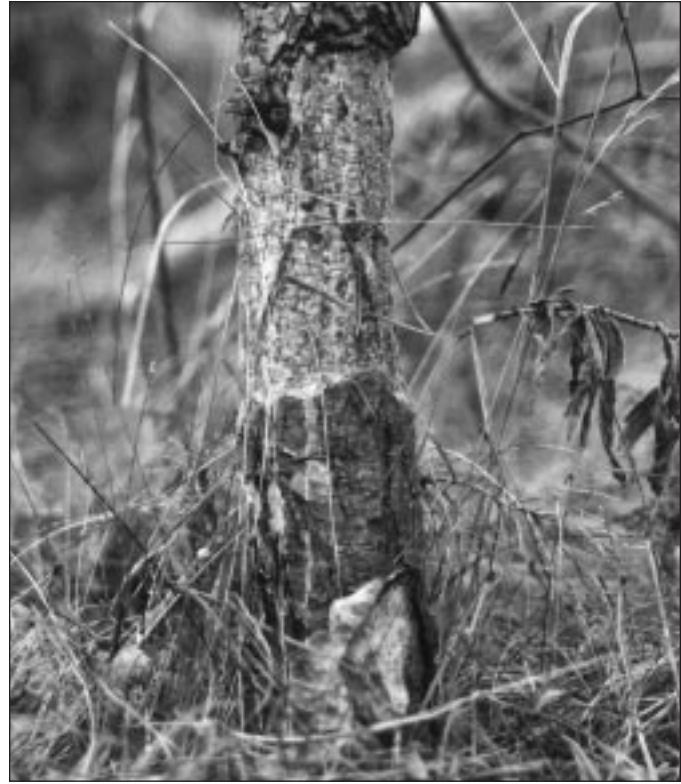
Vole damage kills a tree by stopping the flow of nutrients, water and other materials to and from a tree's root system.