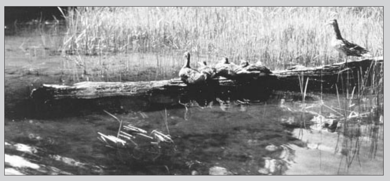
Ponds designed for waterfowl should have an irregular-shaped shoreline and good exposure to sunlight.

All ponds will attract wildlife. However, there are things you can do to entice specific bird and animal species to your site. Ponds designed for waterfowl, for example, are usually no more than 1.2 or 1.5 metres deep with low, sloped banks. These ponds should also have an irregular-shaped shoreline and good exposure to sunlight. Planting fruit bearing shrubs, like dogwood, cranberry and chokecherry, around