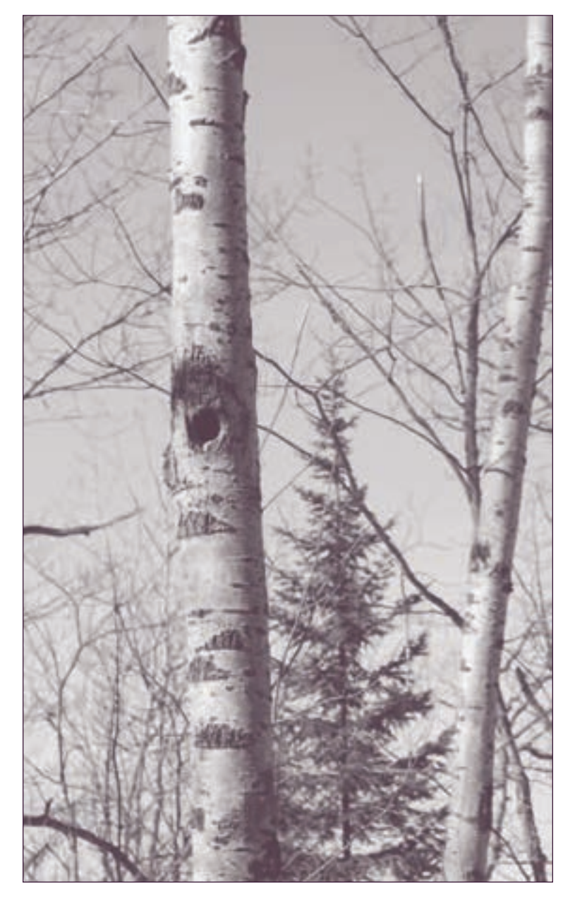
Pileated woodpecker nesting cavity

clean edges and surfaces. The hole may appear dark because it leads to a hollow chamber. Cavities created by wounding or broken branches are often more irregular in shape.