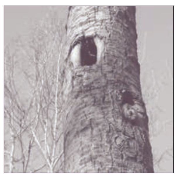
Flying squirrel in roost cavity

Roost trees are used as safe resting sites for a variety of birds and mammals. Pileated woodpeckers, for example, create roosting trees by excavating many holes along the trunk of a hollow tree. At night they enter the hollow by one of the holes and cling to the inside and sleep. This gives them many exits to choose from if a predator tries to trap them inside. Some species may roost in large groups, such as the threatened chimney swift. With the decline of accessible chimneys in urban areas, the presence of large hollow trees for nesting and roosting may be critical to this species.