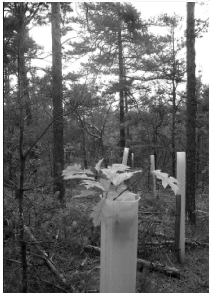
This Scots pine plantation was infected with Diplodia blight causing considerable mortality in the mature trees. The resulting sudden influx of sunlight reaching the forest floor created ideal conditions for the germination of new Scots pine seedlings, most of which were also infected by the same disease. Seedlings of several other tree species, such as the red oak protected by tubex shelters above, were planted because of the lack of suitable natural succession.