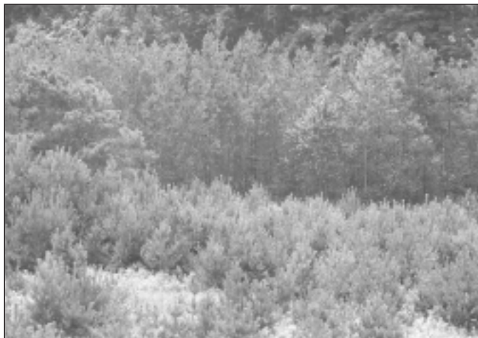
A common scene in parts of southern Ontario, Scots pine has successfully infiltrated a large portion of this abandoned field.

Scots pine is typically a prolific producer of seed, which can disperse considerable distances with wind or by other means and which tends to germinate well under favourable light and soil conditions. Seedling progression into fields and meadows is common where Scots pine seed sources are located nearby. Scots pine seed can also infiltrate and germinate in adjacent forest stands and commonly becomes established along perimeter areas of existing plantations. It can also become established within stand interiors where favourable light conditions exist such as through stand openings created in plantation thinning operations. Undesirable regeneration and succession to Scots pine can be most problematic within an existing Scots pine plantation, especially where there is an absence of established shade tolerant species within the plantation understorey. In some cases, sudden reductions in the density of the plantation crown canopy can occur through insect, disease or through other natural disturbances, effectively creating ideal conditions for the rapid re-establishment of Scots pine.