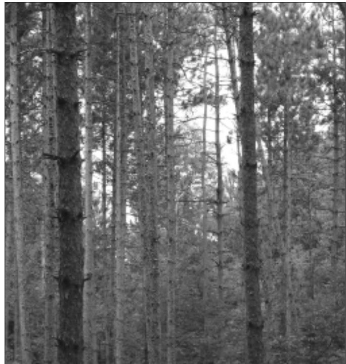
The owner of this recently thinned mixed plantation of Scots pine and red pine plans on removing the full Scots pine component over the course of several thinning treatments.