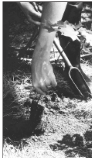
Planting hardwood seedlings can provide a head start to the succession process.

Succession is the natural process of change that occurs in a forest over time as one community of living organisms replaces another. In southern Ontario, succession usually begins in abandoned agricultural fields or after a major disturbance, like wind or ice storms or disease and insect attacks that create areas where new growth can occur. Pioneer species, which are best able to live in harsh conditions, take hold first. These shade intolerant species (tolerance is a measure of how much shade a tree can survive) change the environment as they grow, creating the shaded, moister conditions that more tolerant species need to grow. As conditions improve, mid-tolerant and tolerant species move in and, over time, create a mixed forest with a high component of mid-tolerant species. As the forest reaches the later stages of succession, tolerant species become dominant. Known as climax species, they will dominate the site until disturbances launch the cycle of succession again.