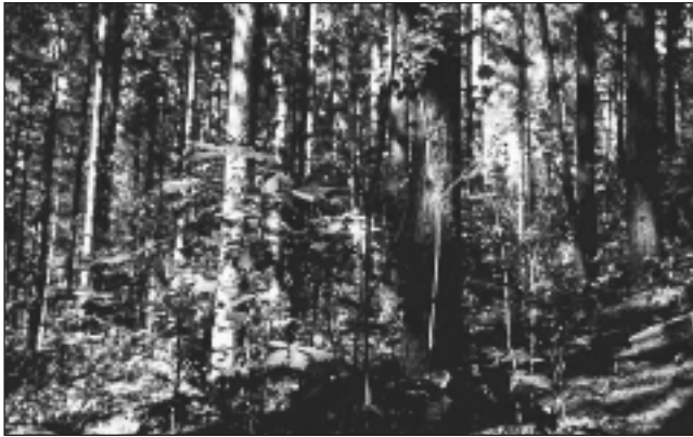
A 60-year-old plantation before the creation of a canopy gap, and understory treatment.