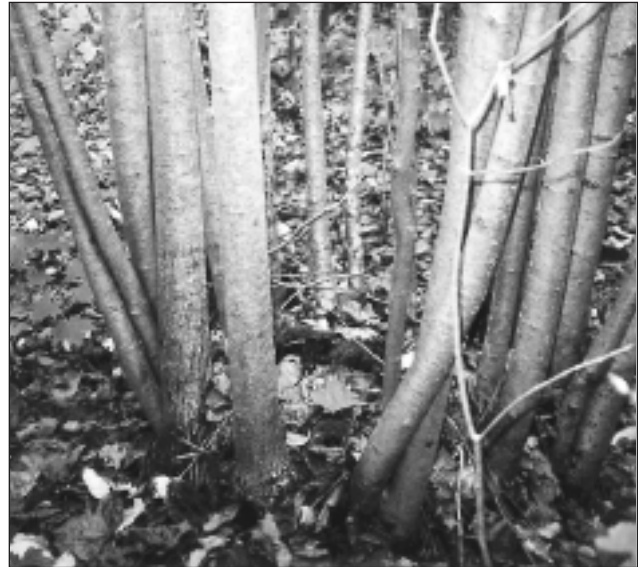
Tall, straight coppice sprouts grow from the base of a cut basswood stump.

Coppice is the regrowth of tree shoots from the stumps and roots of oaks, ashes and most other hardwoods following cutting or other damage. This type of growth produces a dense layer of saplings that often grow faster and straighter than trees grown from seed. This cutting can be used to improve the quality of saplings damaged through thinning and harvesting operations or in cases where extensive damage is expected, as with the creation of larger canopy gaps, managers may consider cutting all hardwood regeneration to the ground prior to gap creation. If possible, do this kind of work in the late fall or winter when trees are dormant.