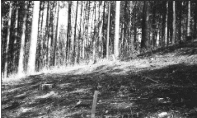
The same area immediately following the thinning operation.