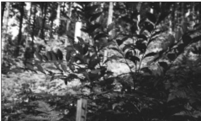
Abundant regrowth of high quality hardwoods after one growing season.

Although extensive thinning in small sized trees (< 8 metres tall) is not recommended, it can be a very good practice to use cutting or other methods to release good quality trees of those species best suited to the site and which best meet your management objectives. By thinning coppice stump sprouts to 1 and 2 stems and providing full crown release for 100 to 200 of the better saplings per hectare managers can greatly increase the growth and quality of their future forest. This type of work should be considered between 9 and 15 years following the creation of the canopy gap.