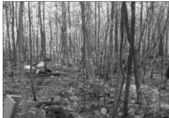
Dense sapling layer after eight years of growth in the canopy gap.

These methods for managing natural regeneration in conifer plantations will eventually produce a diverse, all-aged, mixed forest of hardwoods, white pines and other conifers.